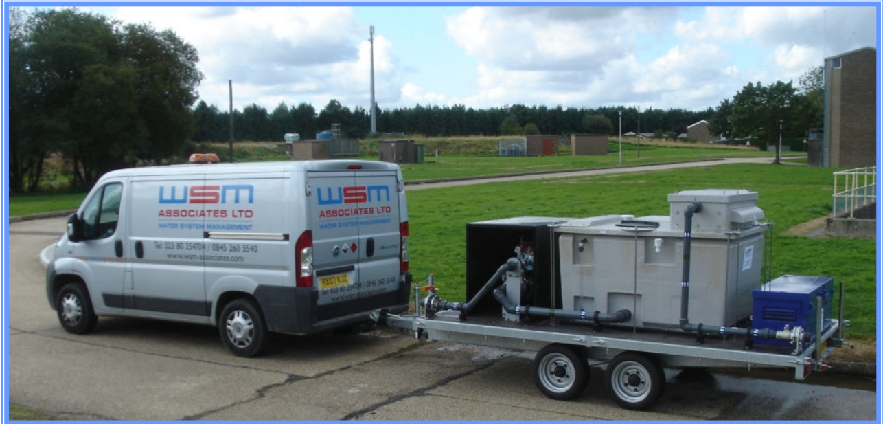
RFF 400 Unit Pictured

Fluid Category 5 Backflow Protection To meet the requirement of the Water Supply (Water Fittings) Regulations For the purpose of supplying Wholesome water to ships in port