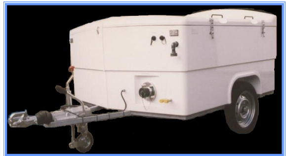
RFS 250 Unit